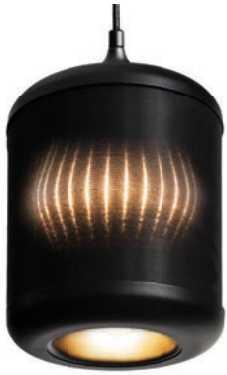
BLACK reflector black