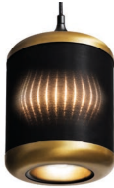
BRASS reflector brass