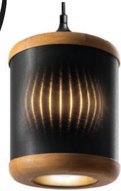
TIMBER reflector black