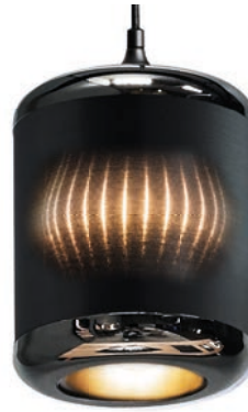
CHROME reflector black